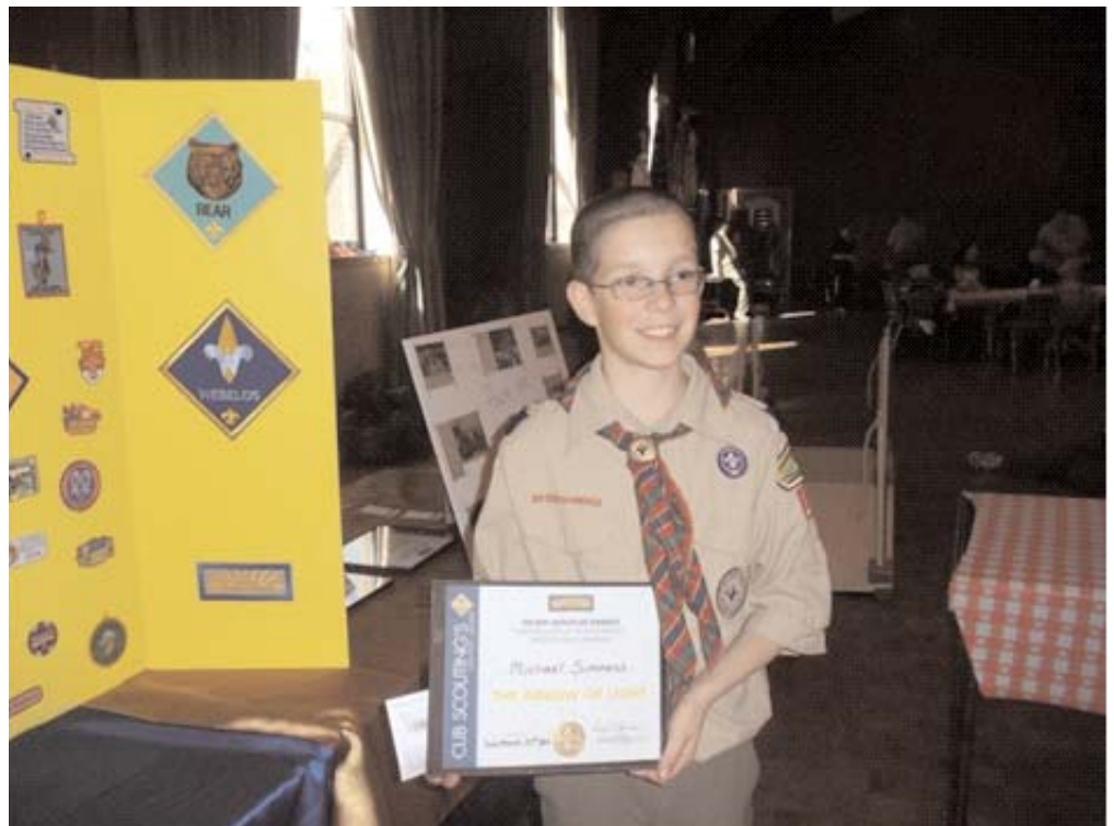
View our pictures at www.troop189ny.com